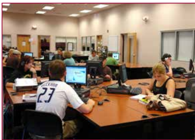
Students make use of the computers in the Academic Resource Center located on the bottom floor of Bland Hall.

given, to the extent possible, for courses listed in the current WCC Catalog . In certain instances, advanced standing credit may be awarded for courses listed in the Virginia Community College System Master Course Guide .