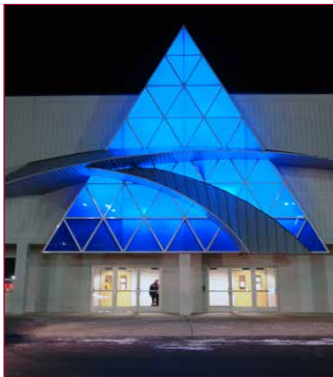
The Crossroads Institute is located at 1117 East Stuart Drive in Galax.

WCC at the Summit Center for Higher Education is located in downtown Marion is about 30 miles south of Wytheville on Interstate 81. The Summit supports WCC curricular offerings, continuing education programs, and community service. Educational activities at the center include day and evening courses, business- and industry-related training, pre-employment training, seminars for small business owners, and personal development workshops. For more information regarding WCC educational opportunities in Smyth County, call the Summit Center at (276) 783-1777.