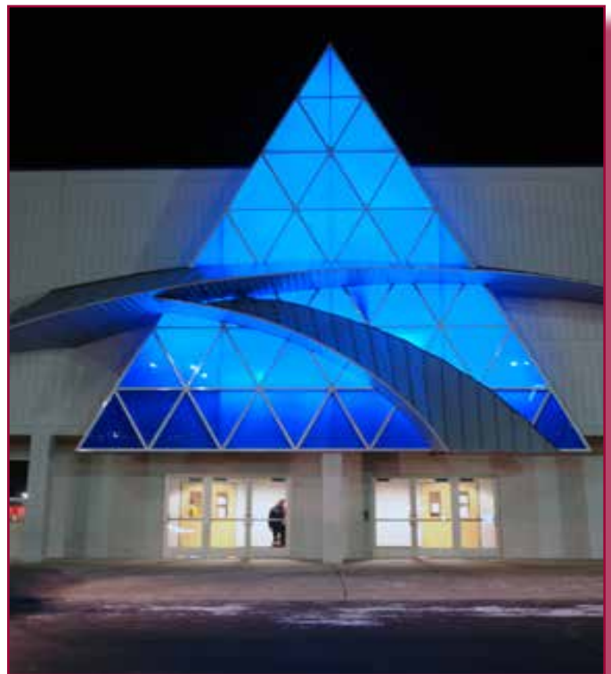
The Crossroads Institute is located at 1117 East Stuart Drive in Galax.

WCC at the Summit Center for Higher Education is located in downtown Marion is about 30 miles south of Wytheville on Interstate 81. The Summit supports WCC curricular offerings, continuing education programs, and community service. Educational activities at the center include day and evening courses, business- and industry-related training, pre-employment training, seminars for small business owners, and personal development workshops. For more information regarding WCC educational opportunities in Smyth County, call the Summit Center at (276) 783-1777..