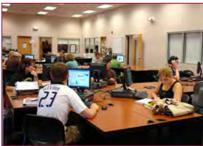
Students make use of the computers in the Academic Resource Center located on the bottom floor of Bland Hall.

Credit awarded through advanced standing is applicable only to WCC's curricular requirements. Students are cautioned that credits awarded through AP examinations,